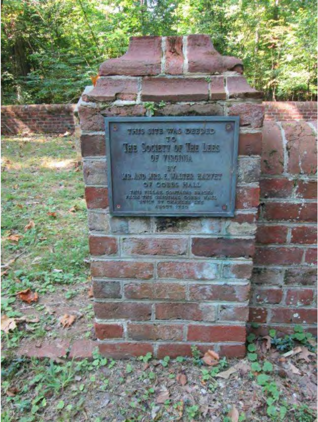
Right Entrance Pillar, September 12, 2013