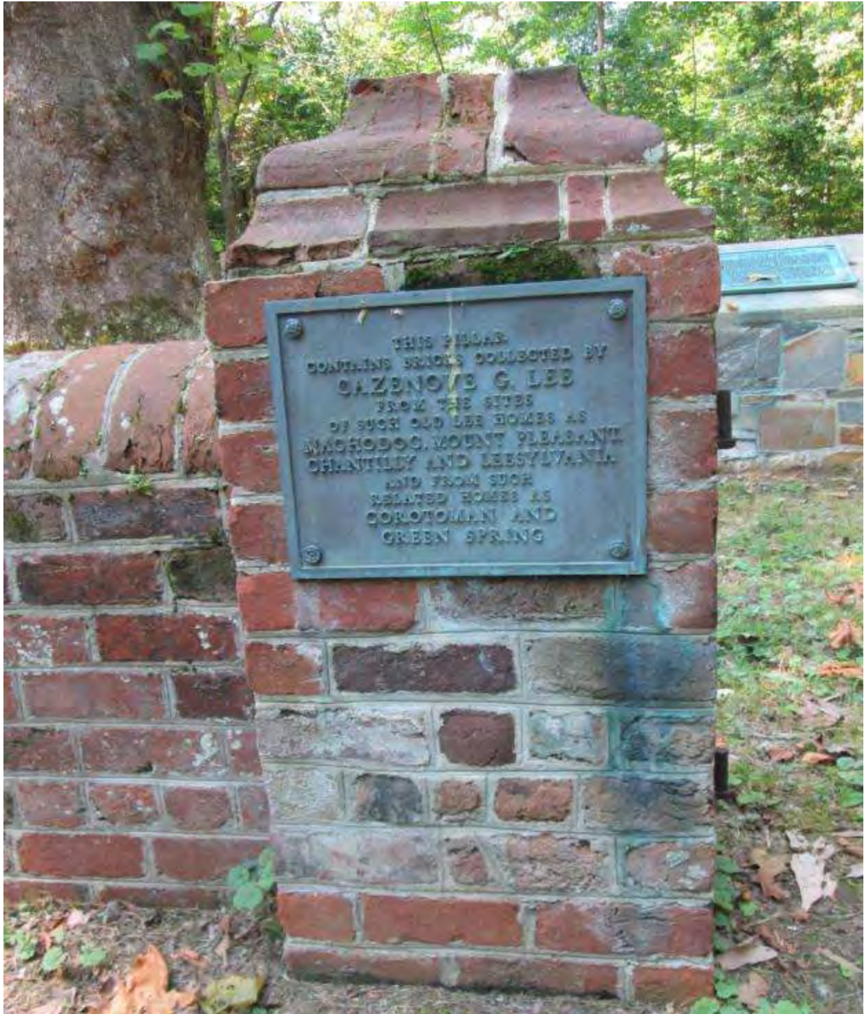
Left Entrance Pillar, September 12, 2013

This picture shows the provision for an entrance gate, which was not installed. Walter Harvey had also saved some bricks from the second Cobbs Hall and they were included in the right entrance pillar. He asked permission to put a plaque on the right wall to record the deeding of the land and this fact.