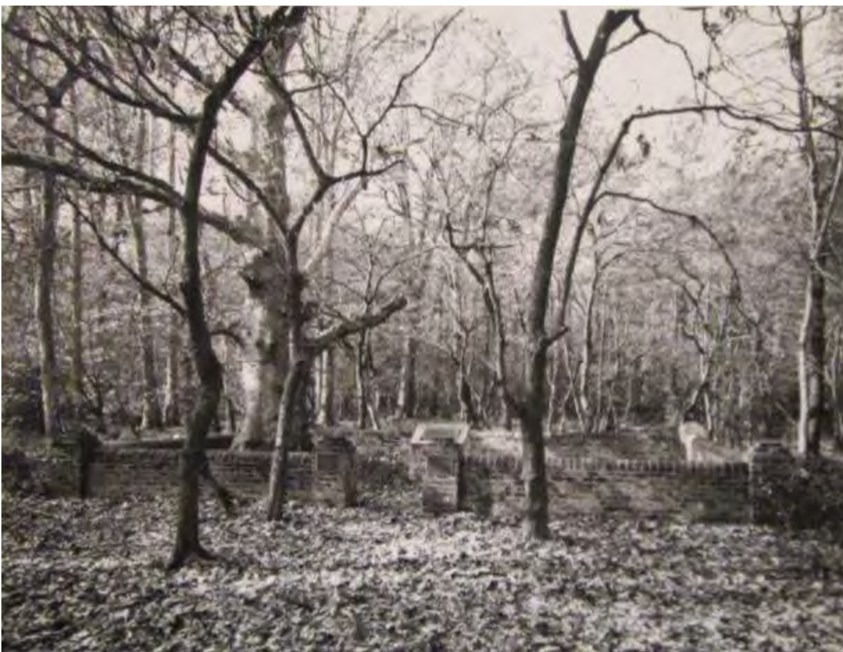
Cobbs Hall Burying Ground, 1957