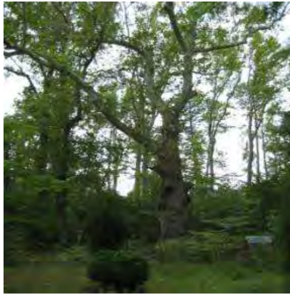
Sycamore Tree, September 2009