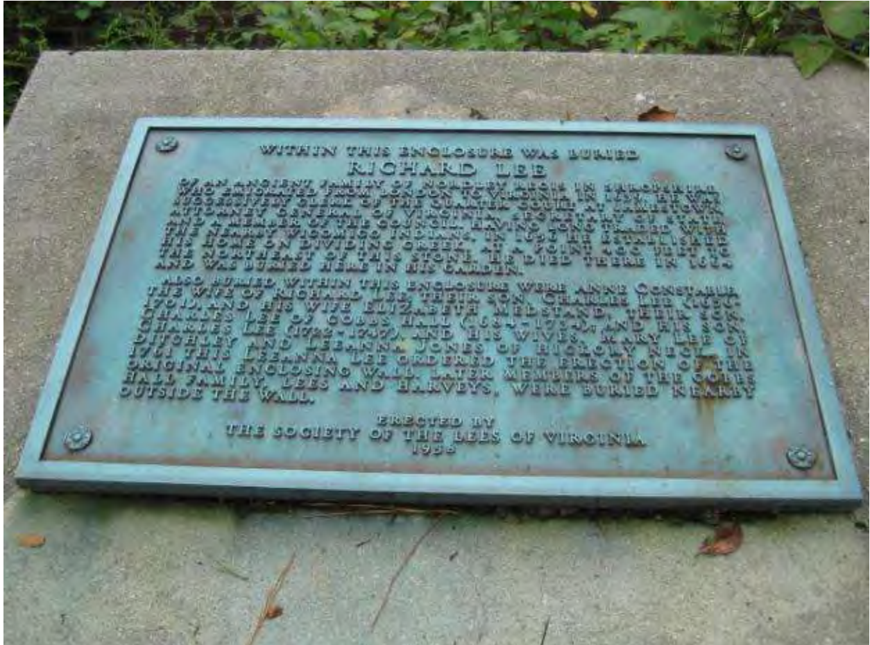
Cobbs Hall Plaque