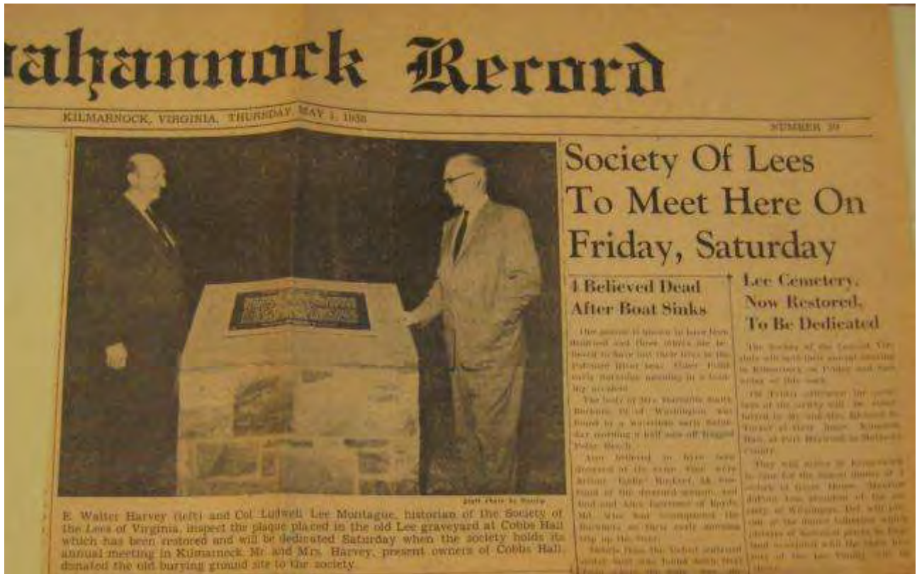
Rappahannock Record, May 1, 1958